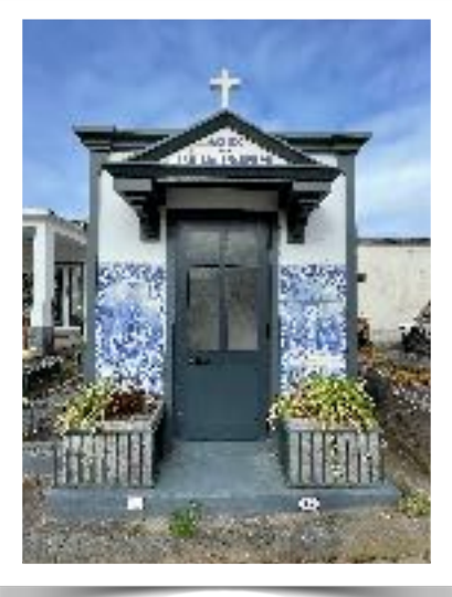
windows allow you to see caskets sitting on shelves inside