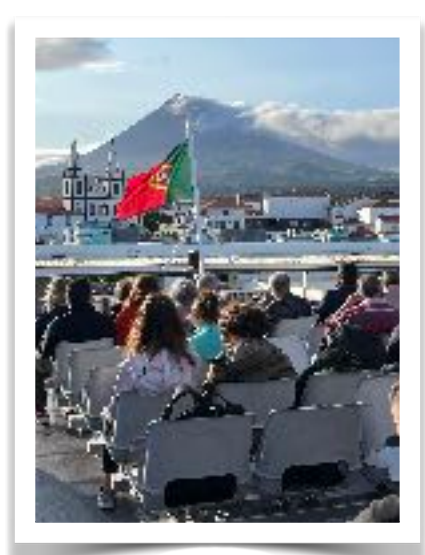
ferry to faial, and the port of horta

us all the very distinctive call of the cory's shearwater, protected birds of the azores. i'm not good with birdcalls, but that is one i will never forget. they are LOUD at night, and claudia has their call down perfectly. we all tried to match it. back to the beautiful room and the loud birds and the eco luxury of the azores. and a good caps game.