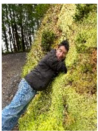
wall of moss!

fulfilling his life's wishes. told him thank you for what he does which seems like such a fucking liberal white woman thing to say. but i