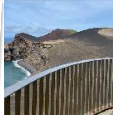
lots of steps to the lighthouse top. but what a view!

ate a picnic lunch at the caldeira park by the volcano's edge. reminds me of the parks at home that have picnic areas and shrubbery for walls.