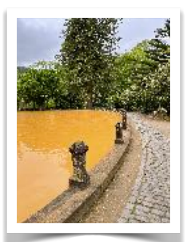
thermal pool looked pretty serene in the dark. you have to take my word for it.

walked around the town of horta for miles and kilometers and hours. got a plant in a rock. got a magnet. took tons of pictures of the sailor's walls, which people have been painting for decades. rained on a lot and had a hoodie, but not