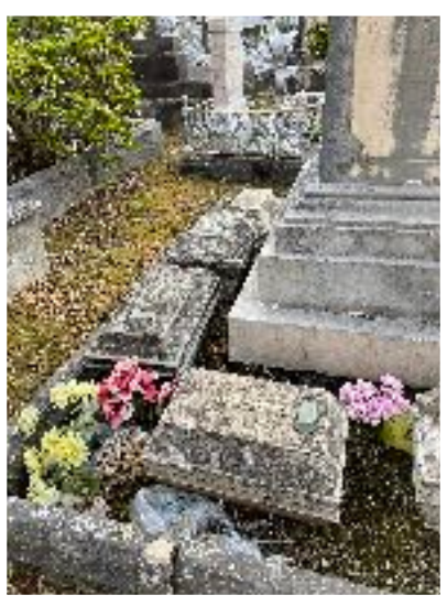
thought these were lots of baby graves, but turns out they are the cremated remains from one family